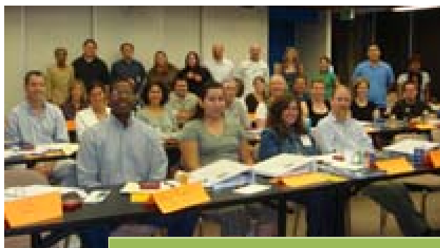
Pictured above are participants attending the new faculty orientation held on August 11.