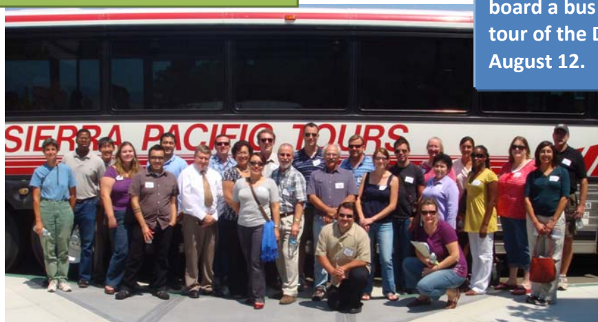
Ready, Set, Go! Faculty and classified employees are pictured ready to board a bus for a guided tour of the District on August 12.

Orientations provide an enthusiastic welcome, full of variety and timely information, and are an opportunity for new employees to meet and hear from key District department personnel, presidents, and representatives from various constituent groups. Participants complete a survey after each orientation that provides feedback for shaping upcoming orientations.